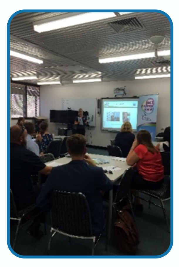
Mentally Healthy Schools Information session – Karratha

We discovered schools in the region were using innovative learning activities to promote mental wellbeing. Following the MHS sessions, Newman Senior High School and Baler Primary School joined the program.