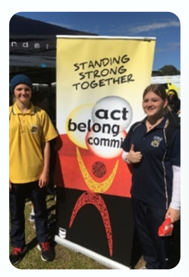
Busselton Senior High School students promote "Standing Strong Together" – the Aboriginal focussed message.